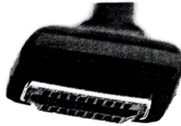
Picture of both end of the Cable