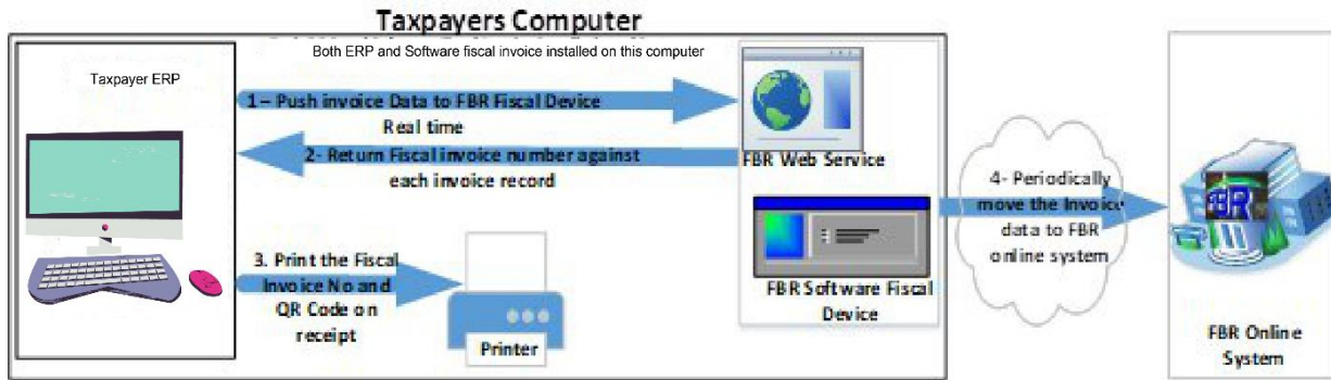
Figure 1 - Invoice Focalization Process

The purpose of this document is to facilitate Supply Chain Operators to understand the methods for Digital Invoice Data sharing with FBR.