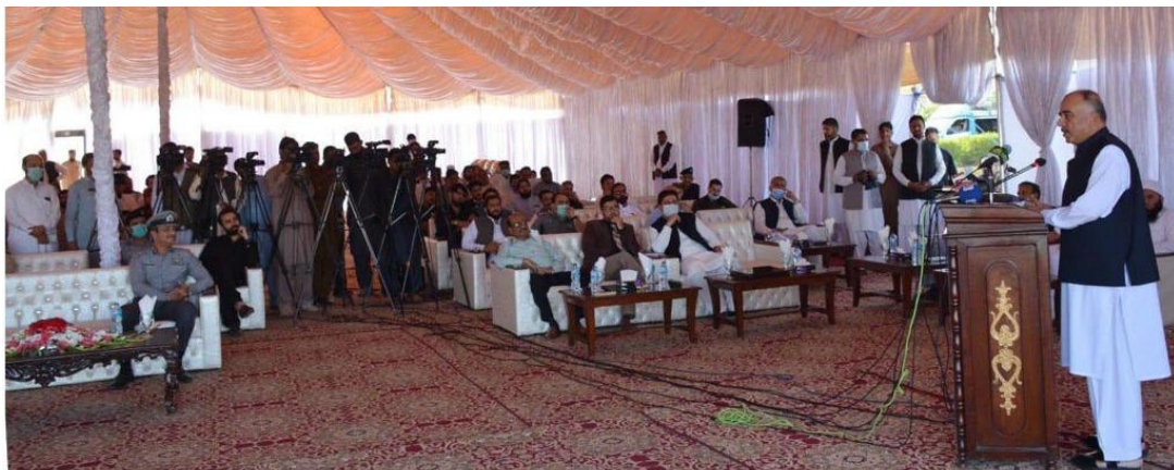
Governor Khyber Pakhtunkhwa Shah Farman addressing a Tree Plantation ceremony arranged by Pakistan Customs here at Regi Lalma, Peshawar on 26/10/2020