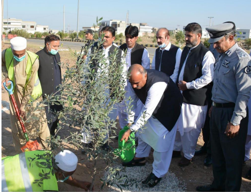
Governor Khyber Pakhtunkhwa Shah Farman Planting a sapling under Governor Fruits for All Program during a Tree Plantation ceremony arranged by Pakistan Customs here at Regi Lalma, Peshawar on 26/10/2020

The Collectorate of Customs E&C, Peshawar held a tree plantation ceremony at Regi Lalma, Peshawar in line with Governor KPK's fruit for all program. The Honorable Governor KPK, Mr Shah Farman attended the ceremony and planted a tree. He appreciated Pakistan Customs ' initiative.