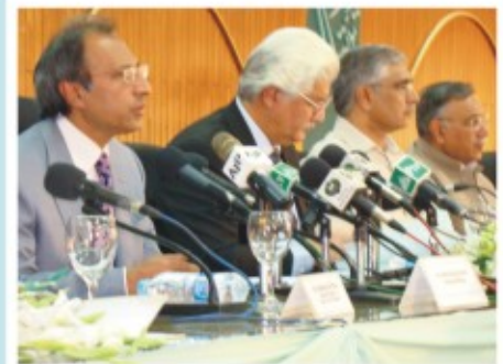
Post-Budget Press Briefing By The Finance Minister Along With Chairman FBR And Other Members.