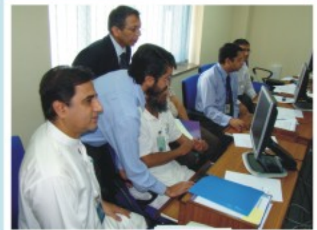
Budget Documents Being Composed