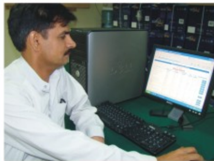
Printing Status Maintained at Computerized Control Room