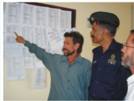
Budget Duties Notified on Notice Board