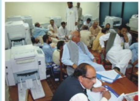
Printing of Budget Documents in Process