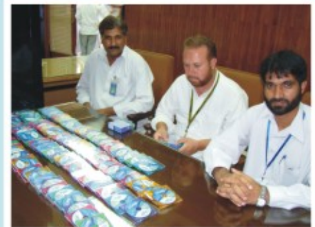
Budget CDs Prepared for Distribution Among Journalists and Taxpayers