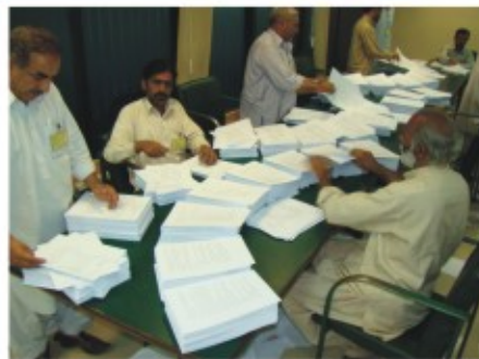
Sorting and Binding of Budget Documents