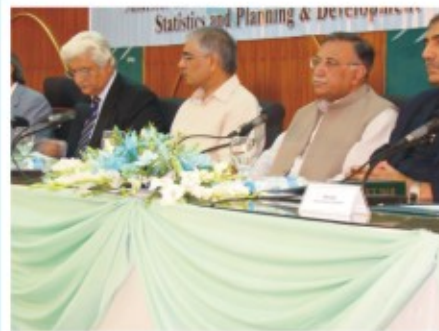
Post-Budget Press Briefing By The Finance Minister Along With Chairman FBR And Other Members.