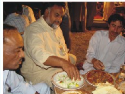
Accounts Team Accounted For