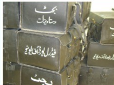
Special Bags Packed With Budget Documents