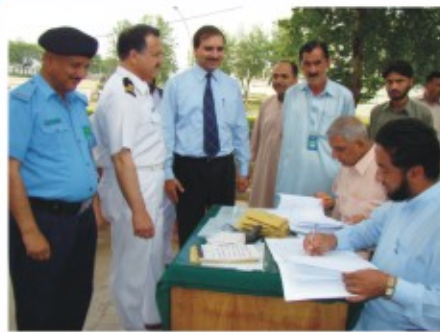
Officials Being Check Listed for Entry into FBR House a Day Prior to Budget Announcement